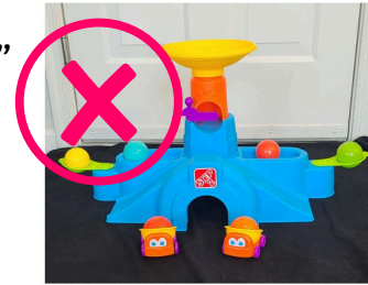
Step 2 Ball Buddies Tunnel Tower Includes 8 balls and 2 cars along with the tunnel tower Preschool Toys