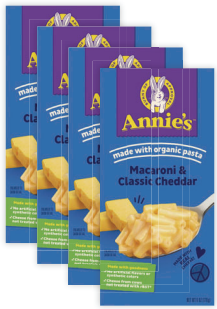
Annie's Mac & Cheese selected varieties