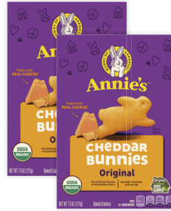
Annie's Organic Bunny Crackers selected varieties