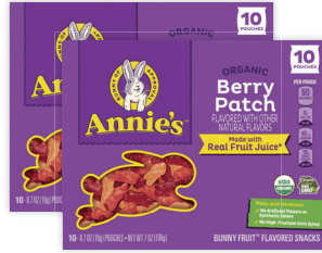
Annie's Organic Fruit Snacks selected varieties