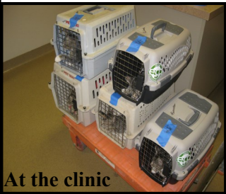
At the clinic

They were all funny little characters, fighting over bottles, and playing and climbing out of every box I put them in as they grew. Then weeks of caring for them were coming to an end, and at over two pounds, they were ready to start on their journey of finding a loving home. They HAD to be spayed or neutered before they left, which was done.