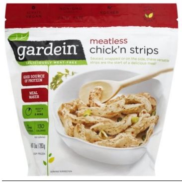
Garden chicken strips are now available in stores (frozen food section) and more fast food restaurants are starting to offer vegetarian choices on their menus! YAY!