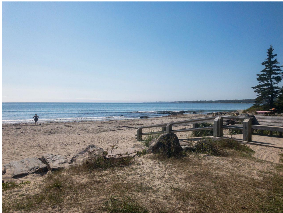
Rissers Beach near Petite Riviere

Continue towards Fort Point Museum - this perfect point was indeed home in 1632 as first capital colonized by France! Get immersed into New Frances settler lifestyle via museum artifacts exhibited here or just unwind surrounded by picturesque landscape.