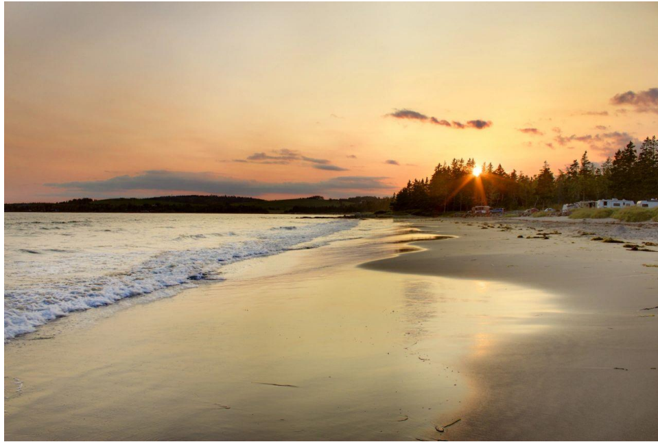
Rissers Beach, Petite Riviere, Nova Scotia