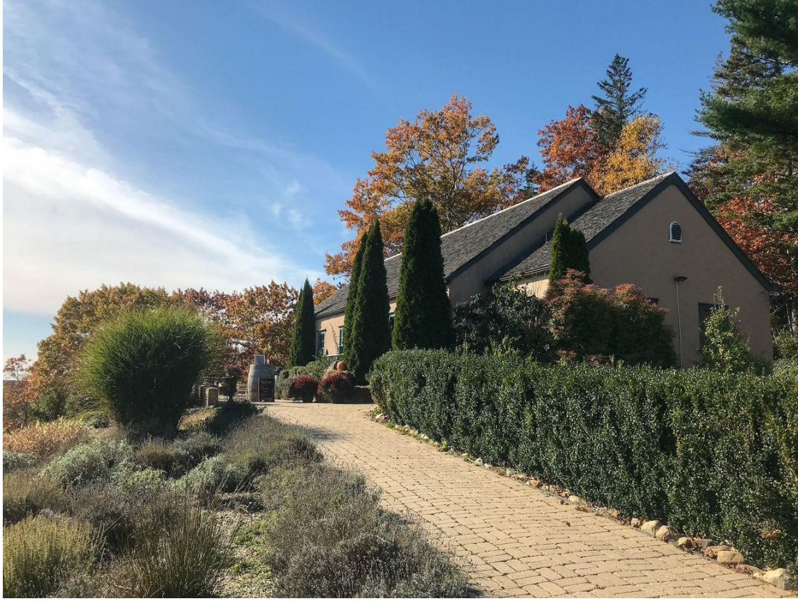
Petite Riviere Vineyards, Crowsetown, Nova Scotia

Get ready for a unique and unforgettable experience at Petite Rivière Winery , just 4 kilometres away from the charming corner store in town. Step into this French-style winery with its picturesque gardens, vineyard views and welcoming atmosphere. Enjoy an intimate wine tasting or splurge on their Ultimate Tour & Wine Tasting -- River Ridge Lodge guests are eligible for special discounts if booked through Frauke!