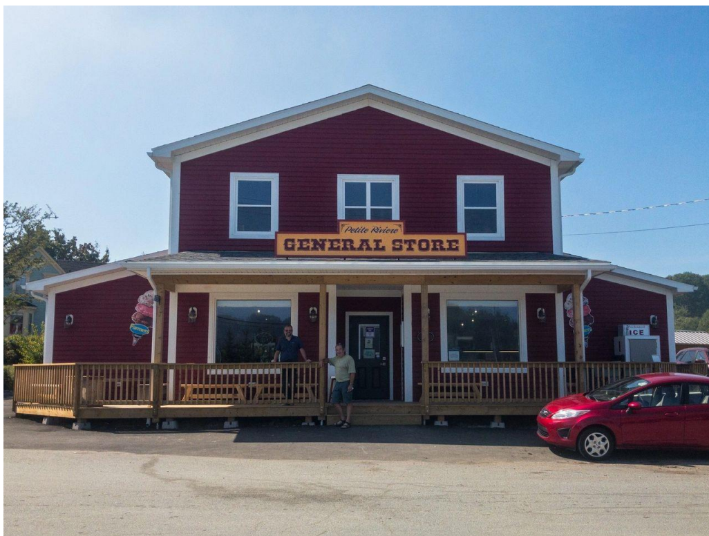
Petite Rivière General Store, Petite Rivière, Nova Scotia

For beach-goers looking for a bite or refreshment, the Osprey's Nest Public House is just around the corner! Located on Hwy 331 and John Rieser Drive, this charming spot offers an inviting patio in warmer weather - complete with live music performances every Saturday plus select Sundays. However, do remember to check their schedule; they're typically open Thursday through Sunday only. Don't miss out (and don't forget those snacks!) when you roam near Petite Rivière.