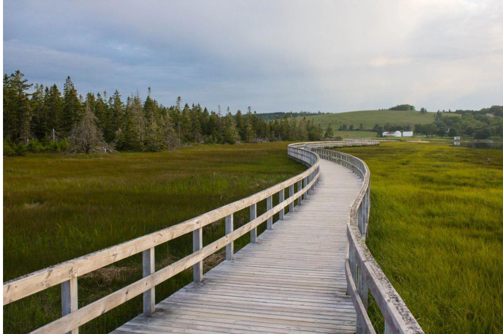
Rissers Beach Boardwalk, Petite Riviere, Nova Scotia

Rissers Beach is a picturesque escape featuring 1.5 kilometres of sandy beach and warm, shallow waters perfect for swimming! On sunny days the beach provides an ideal spot to relax and soak up some sun rays; be sure to take in its beauty with a leisurely stroll all the way down before returning along peaceful Risser Beach boardwalk that follows an inland marsh back toward your parking lot. All seasons are great opportunities to enjoy this fabulous paradise.