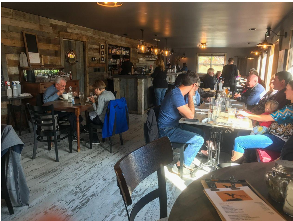
Osprey's Nest Public House, Petite Riviere, Nova Scotia

Rissers Beach is a picturesque escape featuring 1.5 kilometres of sandy beach and warm, shallow waters perfect for swimming! On sunny days the beach provides an ideal spot to relax and soak up some sun rays; be sure to take in its beauty with a leisurely stroll all the way down before returning along peaceful Risser Beach boardwalk that follows an inland marsh back toward your parking lot. All seasons are great opportunities to enjoy this fabulous paradise.