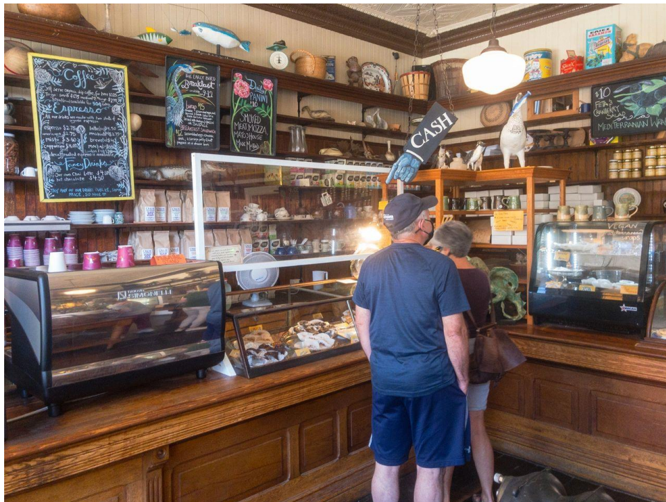
LaHave Bakery, LaHave, Nova Scotia