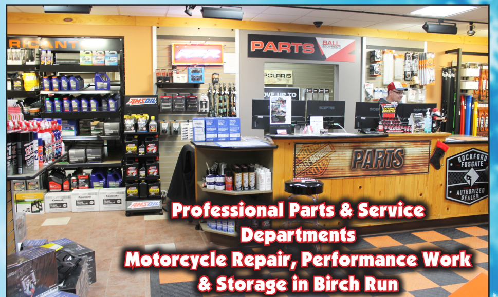
Professional Parts & Service Departments Motorcycle Repair, Performance Work & Storage in Birch Run

RICHMOND 68811 Main St. Richmond, MI 586-430-1252