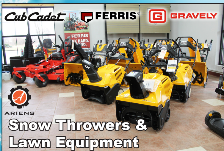
Cub Cadet FERRIS GRAVELY ARIENS Snow Throwers & Lawn Equipment