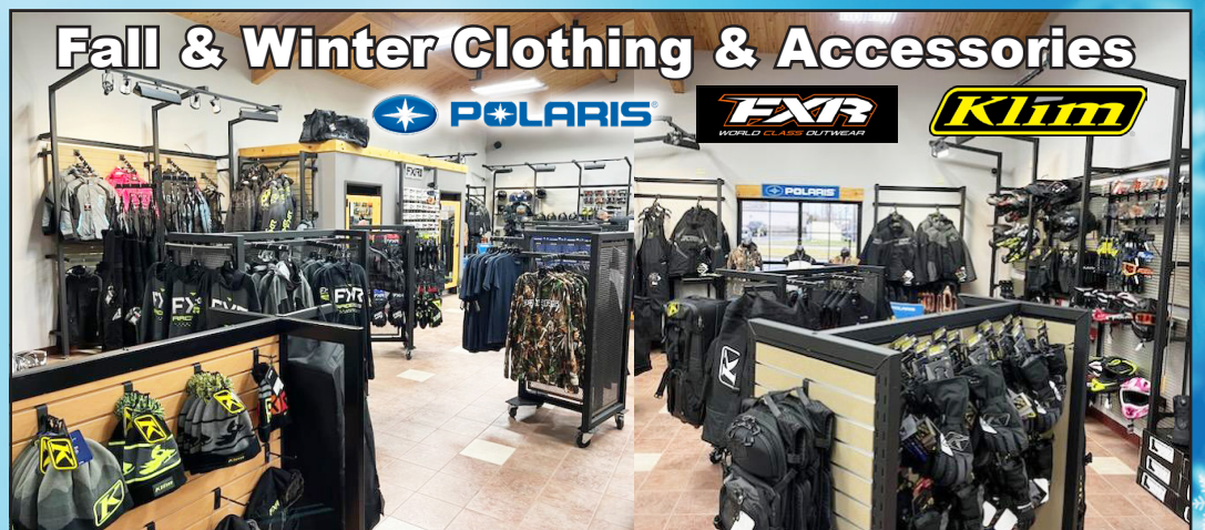
Fall & Winter Clothing & Accessories