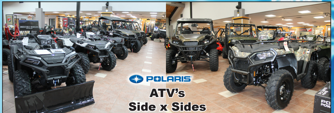
POLARIS ATV's Side x Sides