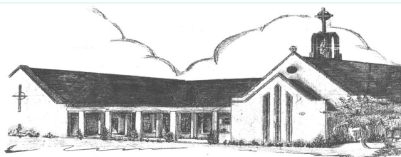
The Episcopal Church of The Advent

But if anyone does sin, we have an advocate with the Father, Jesus Christ the righteous; " 1 John 2:1