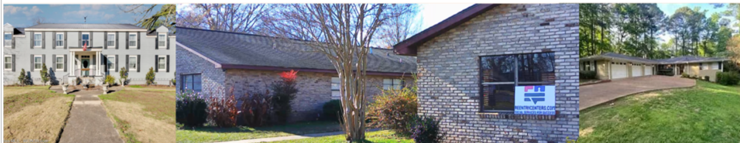
ReentryCenters.com homes in Alabama house 10-to-200 participants, who pay $195/week from their paychecks.