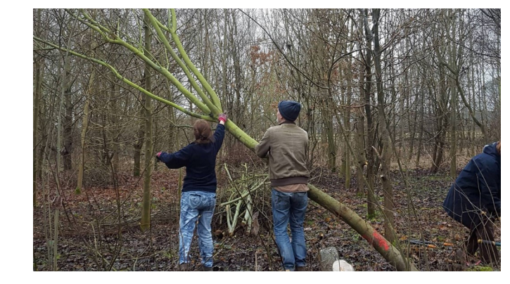
Friends at work

There is a public footpath through one corner of the wood, but the public has open access at all times to enjoy the naturalness and tranquility it provides.