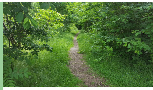
Springdale Wood-central path

ment for people and wildlife in East Bridgford