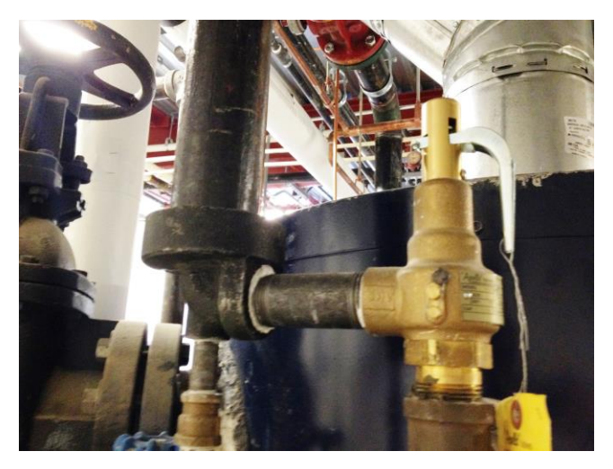
A pop safety relief valve piped into a drip pan ell.

Another advantage of using lower pressure steam is the steam volume. The volume of steam at 11 psi is 16 cubic feet, and the volume of steam at 15 psi is 14 cubic feet. You would need to