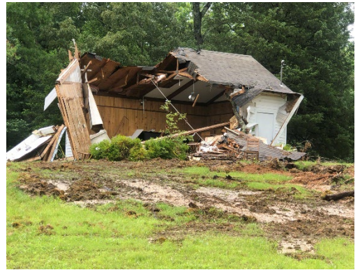
After the Storm