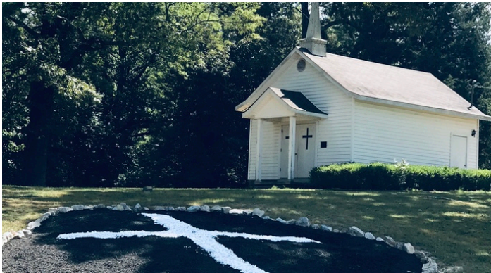
Before the Storm