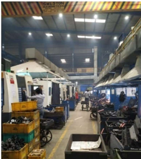
CNC MACHINING SURFACE TREATMENT