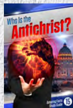
Study Guide 15: Who Is the Antichrist?

Each Study Guide is filled with amazing facts that will affect you and your family. Don't miss a single one!