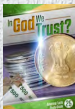
Study Guide 25: In God We Trust?