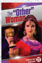
Study Guide 22: The "Other" Woman