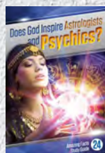
Study Guide 24: Does God Inspire Astrologists and Psychics?