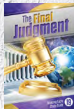
Study Guide 19: The Final Judgment