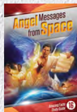
Study Guide 16: Angel Messages from Space