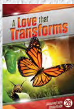
Study Guide 26: A Love that Transforms