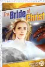
Study Guide 23: The Bride of Christ