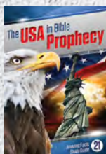
Study Guide 21: The USA in Bible Prophecy