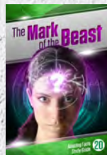
Study Guide 20: The Mark of the Beast