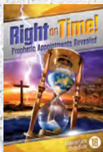
Study Guide 18: Right on Time!