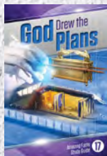
Study Guide 17: God Drew the Plans