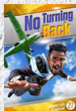
Study Guide 27: No Turning Back

Have you seen our first 14 Study Guides? If not, be sure to write to: