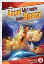
Study Guide 16: Angel Messages from Space