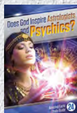
Study Guide 24: Does God Inspire Astrologists and Psychics?