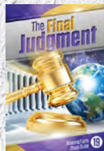
Study Guide 19: The Final Judgment