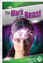
Study Guide 20: The Mark of the Beast