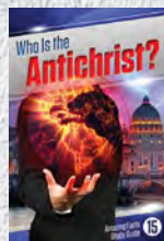
Study Guide 15: Who Is the Antichrist?

Each Study Guide is filled with amazing facts that will affect you and your family. Don't miss a single one!