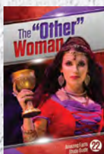
Study Guide 22: The "Other" Woman