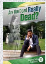
Study Guide 10: Are the Dead Really Dead?