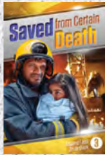
Study Guide 3: Saved from Certain Death