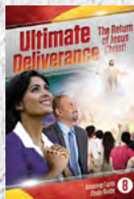
Study Guide 8: Ultimate Deliverance