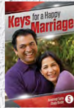
Study Guide 5: Keys for a Happy Marriage