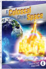
Study Guide 4: A Colossal City in Space