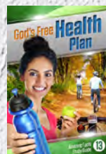
Study Guide 13: God's Free Health Plan