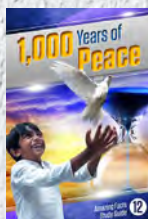
Study Guide 12: 1,000 Years of Peace