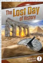
Study Guide 7: The Lost Day of History