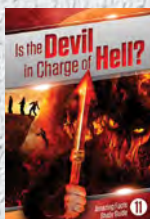
Study Guide 11: Is the Devil in Charge of Hell?