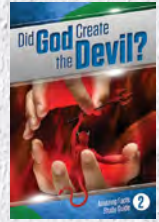
Study Guide 2: Did God Create the Devil?