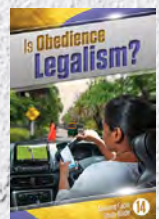
Study Guide 14: Is Obedience Legalism?

When you have completed the first 14 Study Guides, ask about our advanced set by writing: