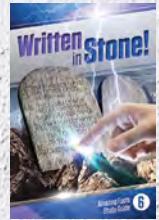
Study Guide 6: Written in Stone!