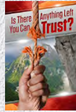
Study Guide 1: Is There Anything Left You Can Trust?

Each lesson is filled with amazing facts that will transform you and your family and bring you lasting hope. Don't miss a single one!