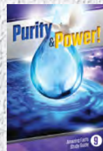
Study Guide 9: Purity & Power!