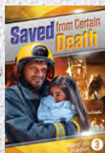
Study Guide 3: Saved from Certain Death