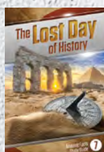
Study Guide 7: The Lost Day of History