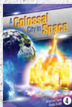
Study Guide 4: A Colossal City in Space