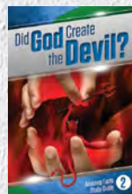
Study Guide 2: Did God Create the Devil?