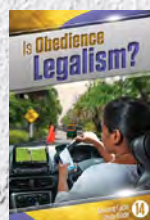
Study Guide 14: Is Obedience Legalism?

When you have completed the first 14 Study Guides, ask about our advanced set by writing: Amazing Facts India, Post Box No 51, Banjara Hills, Hyderabad - 500034