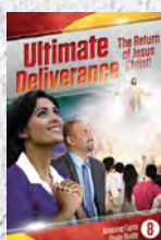
Study Guide 8: Ultimate Deliverance