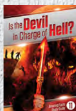
Study Guide 11: Is the Devil in Charge of Hell?