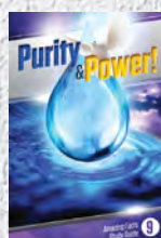
Study Guide 9: Purity & Power!