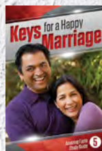
Study Guide 5: Keys for a Happy Marriage