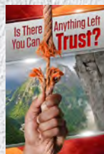
Study Guide 1: Is There Anything Left You Can Trust?

Each lesson is filled with amazing facts that will transform you and your family and bring you lasting hope. Don't miss a single one!