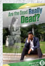
Study Guide 10: Are the Dead Really Dead?