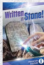
Study Guide 6: Written in Stone!