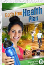
Study Guide 13: God's Free Health Plan