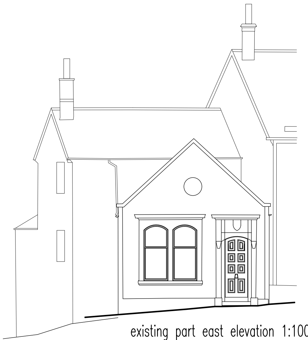
existing part east elevation 1:100