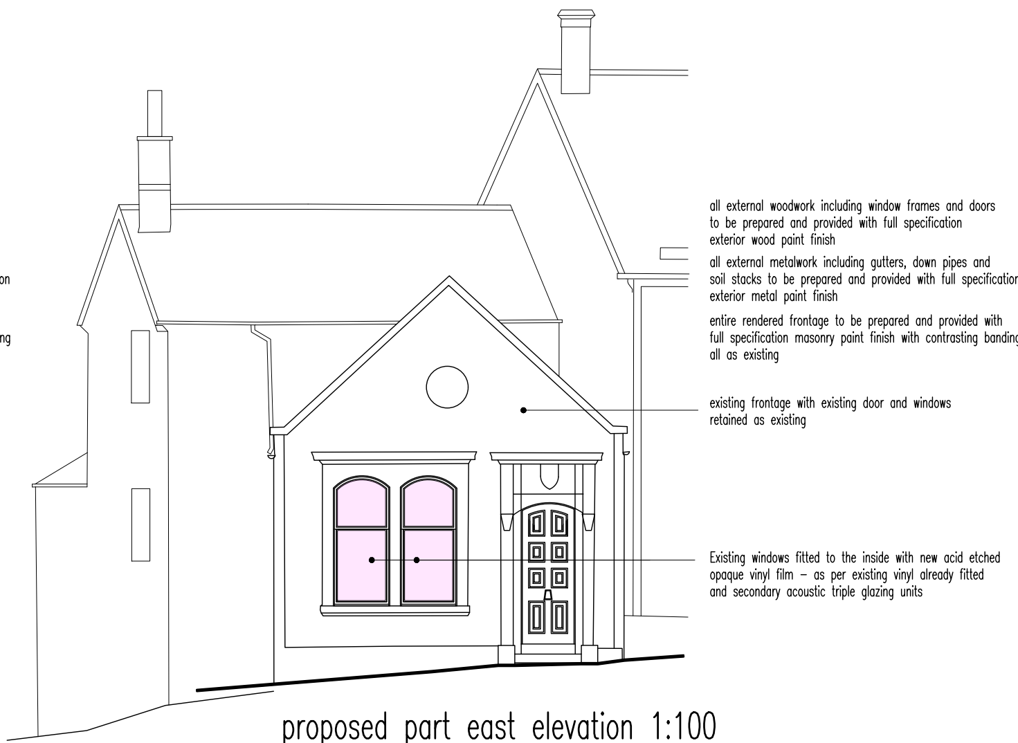
proposed part east elevation 1:100