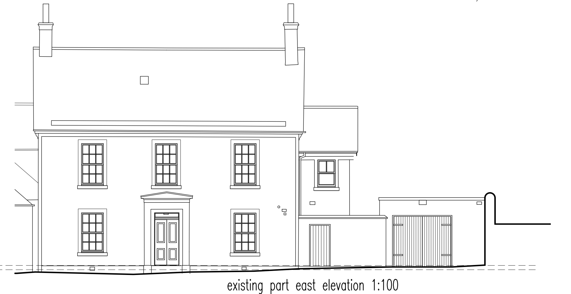
existing part east elevation 1:100