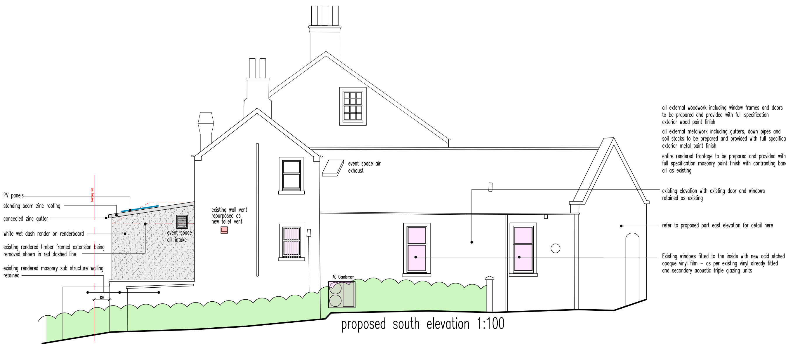
proposed south elevation 1:100