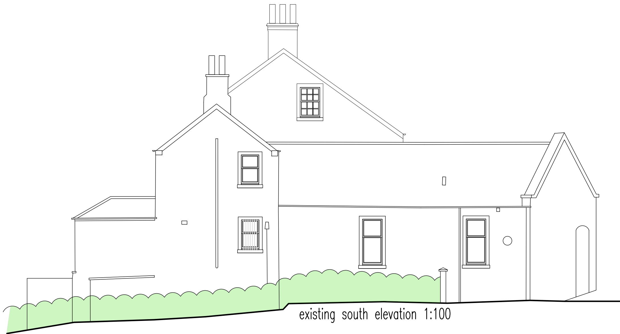
existing south elevation 1:100