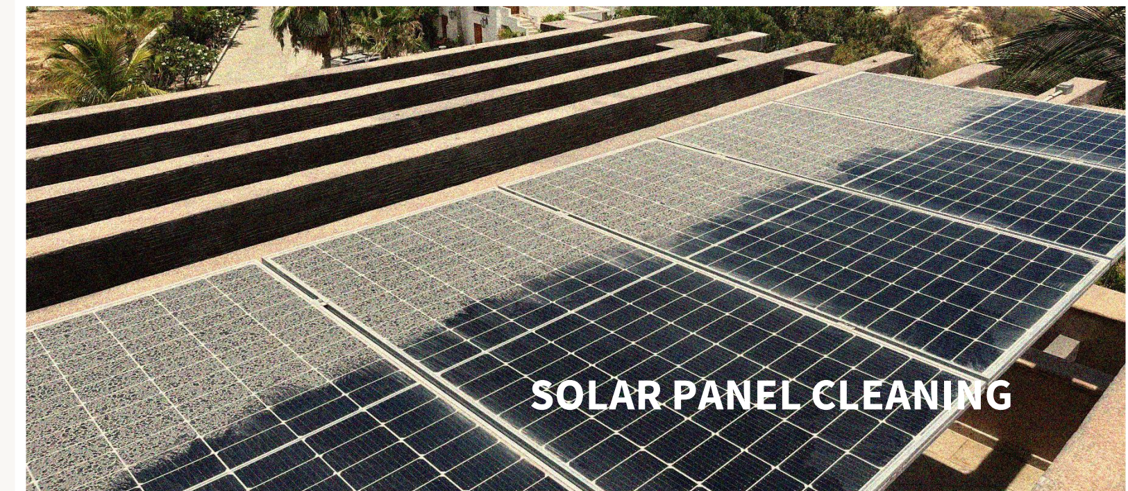
SOLAR PANEL CLEANING