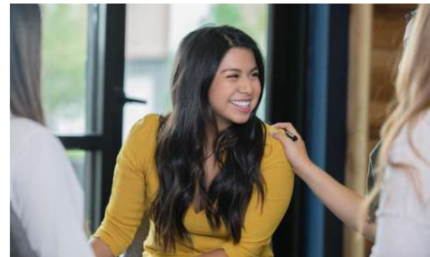
On-site Barista • Rooftop garden & BBQ • Student counsellor • Prayer room