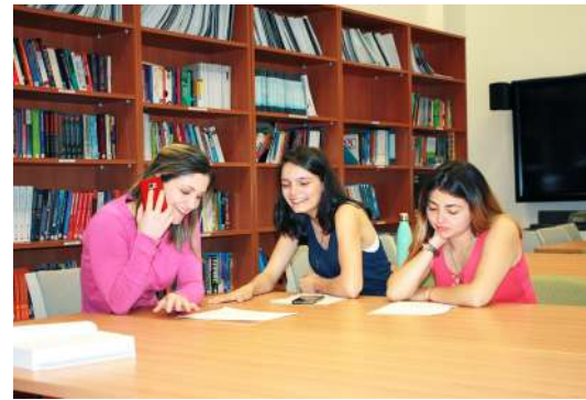
Modern classrooms • Interactive whiteboards • Computer labs • Library