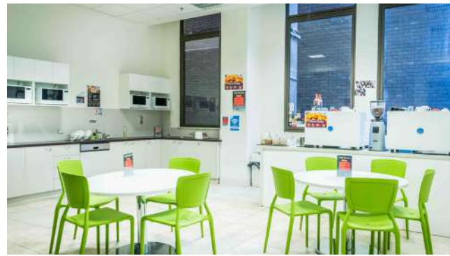
Student lounge • Student cafe • Student kitchenette