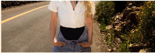
Tamar Berk