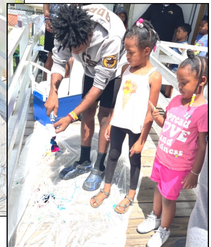
Kids engrossed in learning how to tie-dye T-shirts