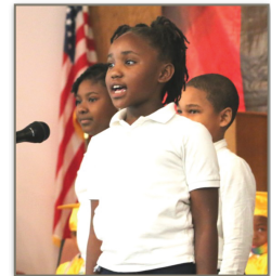
Second grader leads students in school pledge.

This is one of many milestones these children will reach. Over the past few years they have been nurtured in the Word and given the first building blocks toward a strong academic foundation. This Bible-based foundation will continue to be built on throughout each student's experience at Genesis One Christian School.