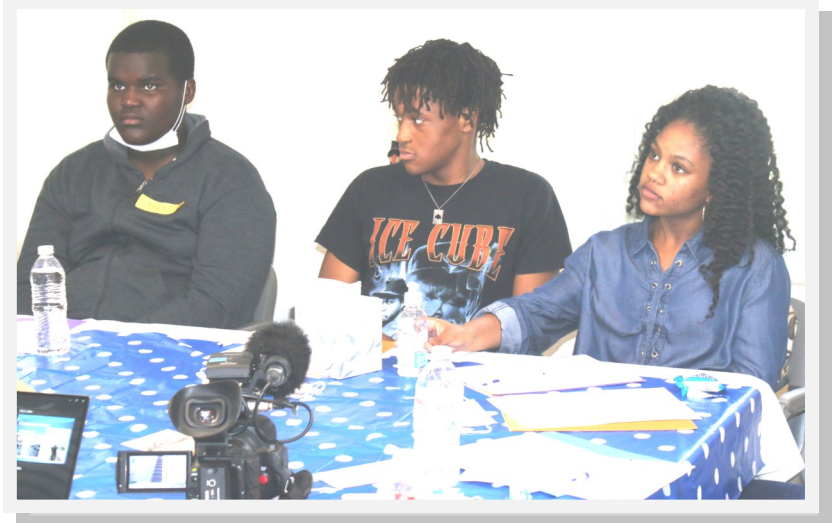
Youth participants listen attentively during class on film production

There was never a dull moment during the Youth Leadership Development/Summer Enrichment Program this summer.