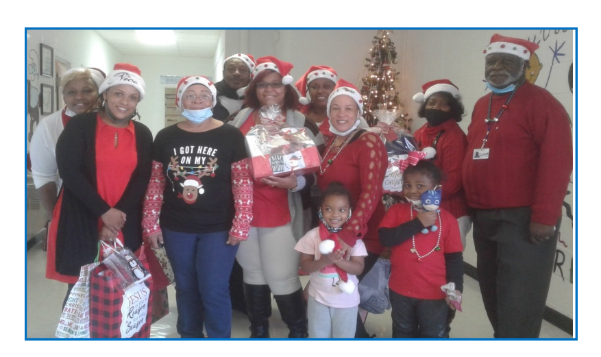
A big "THANK YOU" from GOCS staff and students for gifts they received at Christmas