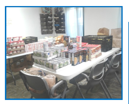
Unloading donations from Truck