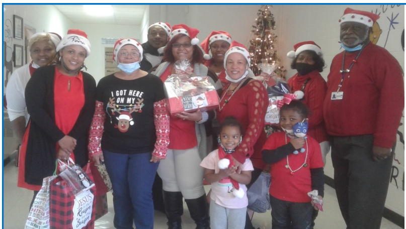
A big “THANK YOU” from GOCS staff and students for gifts they received at Christmas