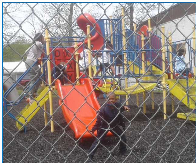
Kids enjoying recess on GOCS new playground

Congratulations to principal, teachers, and staff for a job well done!