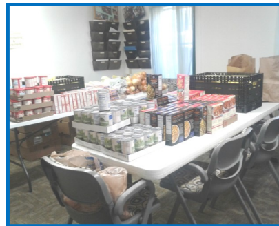
Unloading donations from Truck