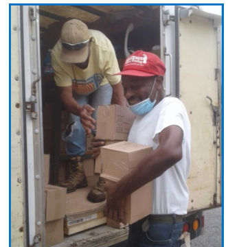
Donated food & household supplies ready for distribution