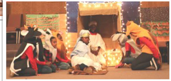
The Nativity Scene