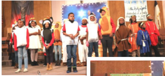
"Siyahamba," (Marching in the Light of God)

Well done teachers, students, parents and volunteers!