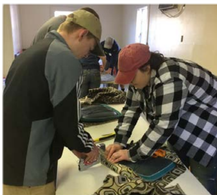
Volunteers from Dordt College re-upholstering chairs

From Ontario, Canada to Seattle, WA to Tampa, FL, people answer the call of God on their lives to serve in Mendenhall. TMM has been blessed to host nine volunteer groups this year. Each group played a significant role in helping with the Ministry's rebuilding effort. These groups were from: First Baptist Church of College Hill (X2); University Presbyterian.