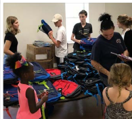
Volunteers from University Presbyterian Church help with Backpack Give-Away Day

Grace Church of Ridgeland is scheduled to serve in September.