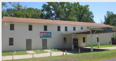
GOCS: 1984 - 2020

In 1978, GOCS's students began their formal educational journey in the former