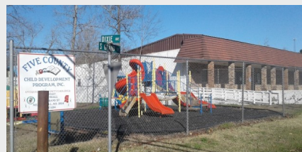
Future Home of GOCS

The former Thrift Store housed the Five-County Head Start Center over the past 20 years, from 1999 to 2019. Because it has been recently used and maintained as a pre-school facility, minimum structural