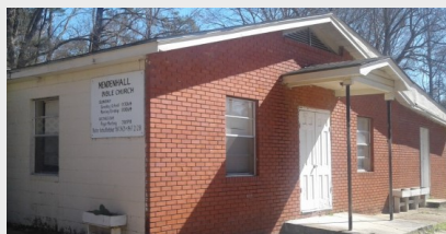
GOCS: 1978 - 1984

Genesis One Christian School (GOCS) is moving from 717 Center Street to 104 South Grand Street, closer to the railroad tracks (that have historically divided the communities). Volunteers are transforming the former TMM Thrift Store into an exciting and welcoming learning center for kids, pre-school to fifth grade, in anticipation of the 2020/21 academic year.