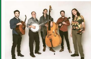
Chicken Wire Empire Saturday Only