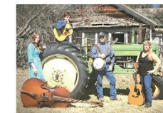
The William Lawson Band Friday Only

Strawberry Point, Iowa July 24, 25, 26 - 2026