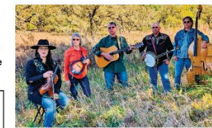
Grass Attack Friday and Sunday