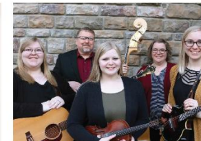
The Bluegrass Blondies Saturday and Sunday