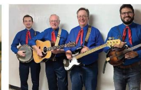
Bluegrass Express Friday and Saturday