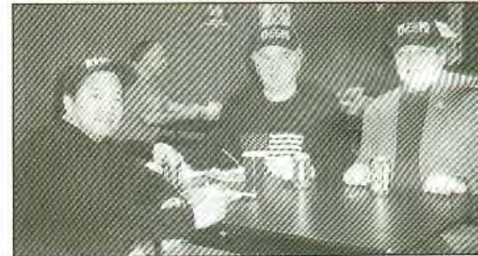
We TOLD YOU sales were brisk!