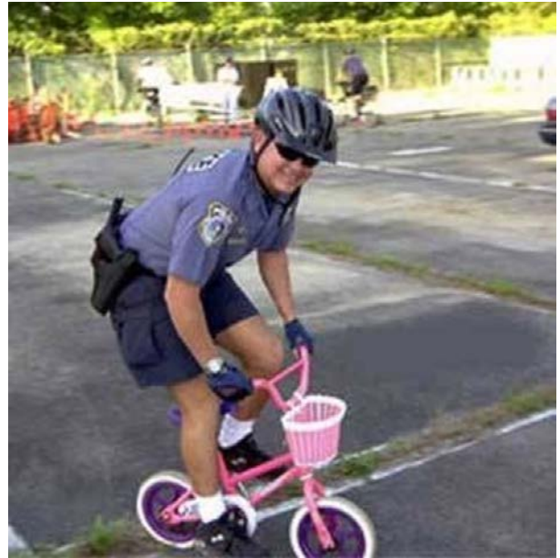
NEW MOTORCYCLE DIVISION UNDER ADAMS