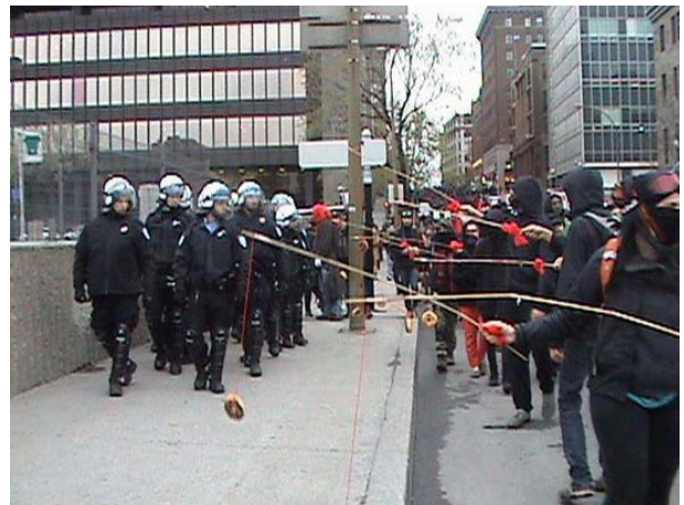
FISHING FOR COPS

more awesome pictures at THEMETAPICTURE.COM