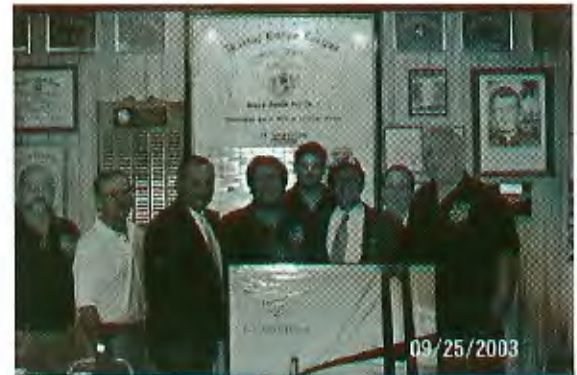
Chief Assistant Staten Island D.A. wearing NYC VZ 10-13 cap poses with Chapter Board of Directors after speaking to membership.