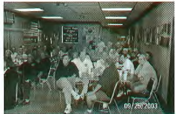
A full house of NYC VZ 10-13 members listened attentively to the array of speakers on hand for their meeting.