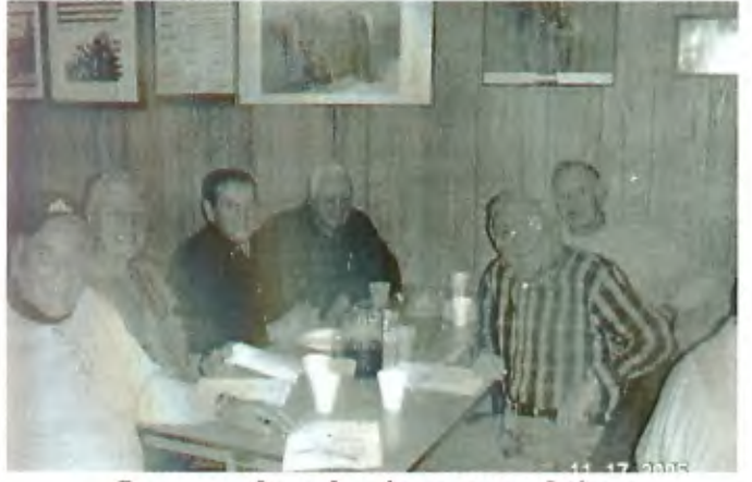
Our members having a grand time at the November meeting