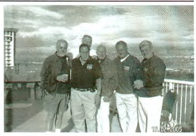
Vew from the top of the Riverside Casino