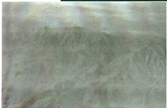
View of the Rocky Mountains on our way to the Arizona Convention