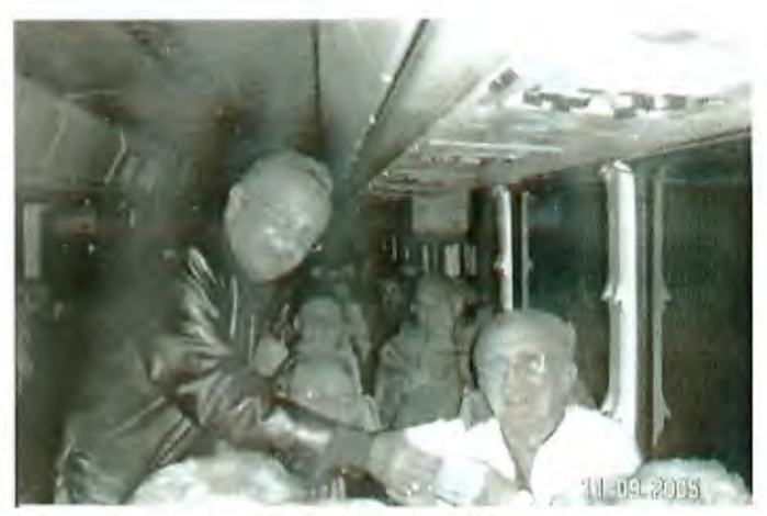
Another "Big" Winner!