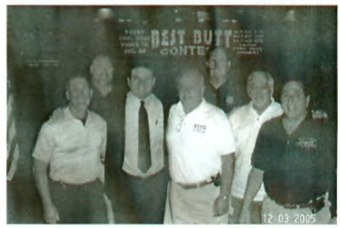
Executive Board members from the Arizona 10-13 and the Verrazano 10-13. Who do YOU think won the contest?