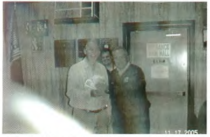
Another big winner at the November meeting