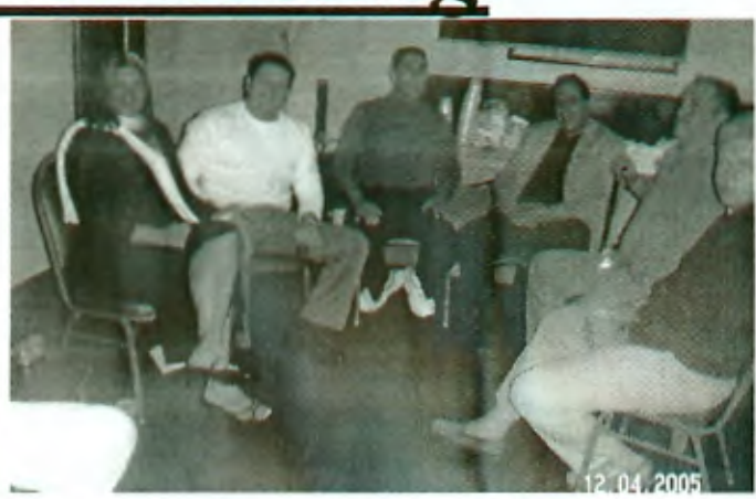
Relaxing in the Hospitality Suite