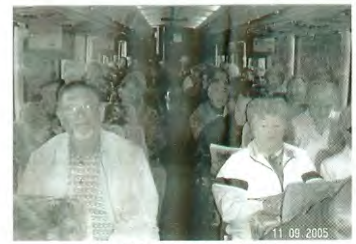
Great Crowd - Great Time!

Visit our Website at <u>www.nycop.com</u> to find out all the latest information concerning your NYC Verrazano 10-13 Association!