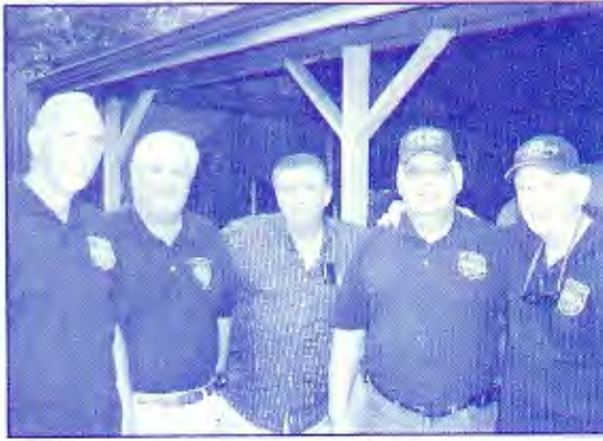
Don't forget the guys that feed us!