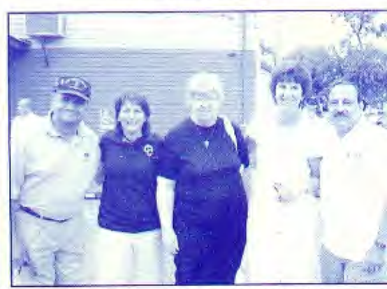
The Old. (old) Manhattan Narcotics Crew.