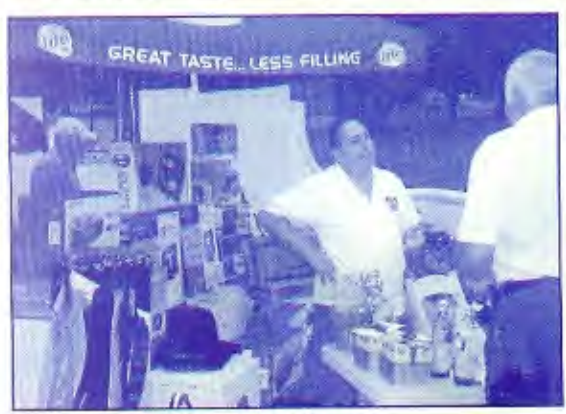
No I'm not Monty Half.