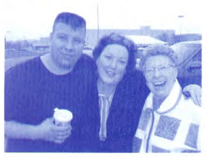
APRIL 27, 2007