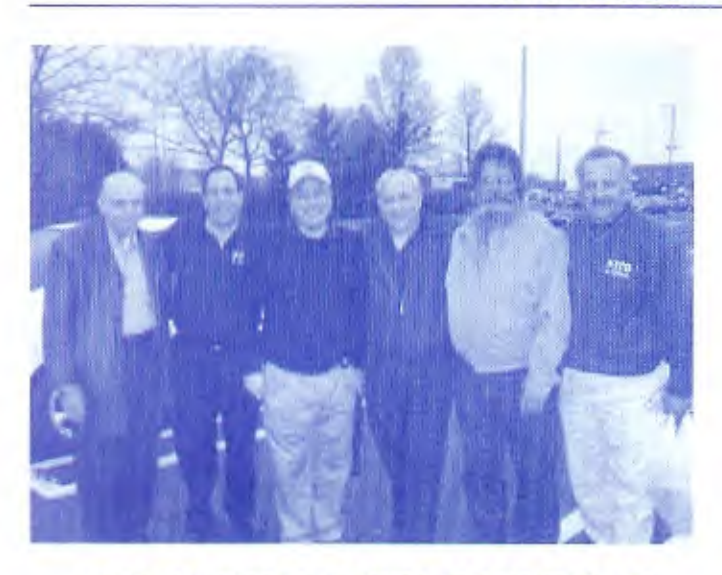
ATLANTIC CITY BUS TRIP