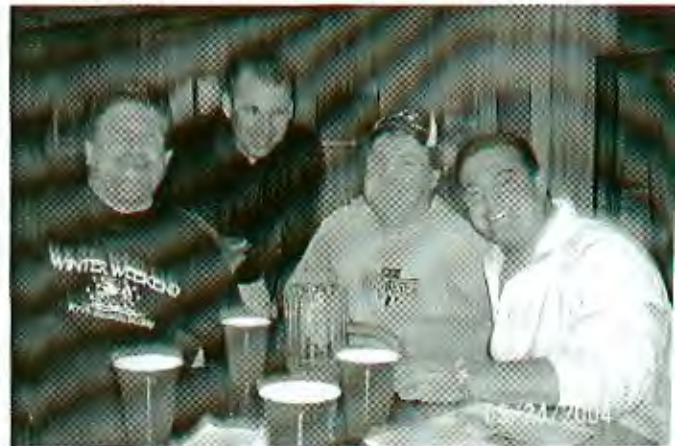
"The Red Cups Are Coming, The Red Cups Are Coming!"