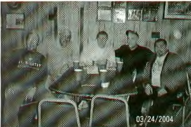
"The Red Cups Are Coming, The Red Cups Are Coming!"