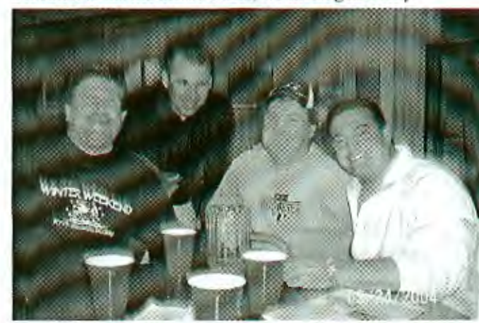
"The Red Cups Are Coming, The Red Cups Are Coming!"