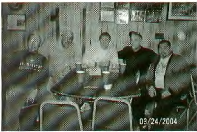
"The Red Cups Are Coming, The Red Cups Are Coming!"