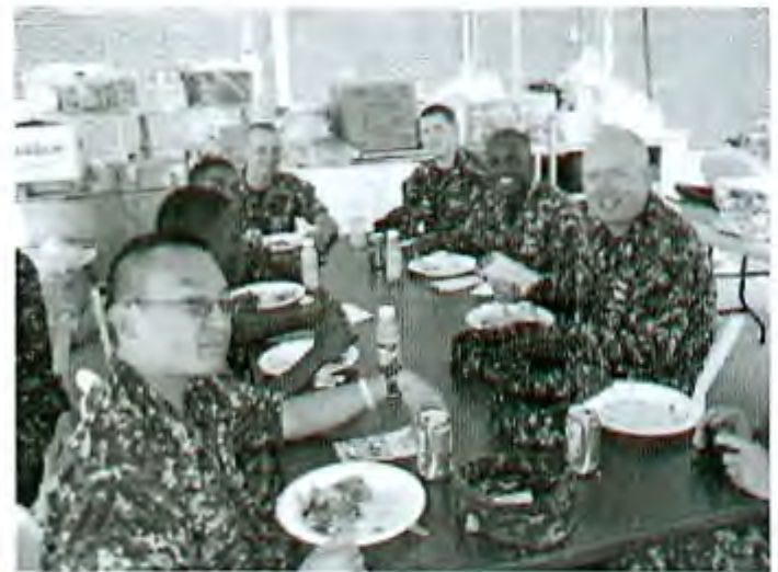
Some of our troops enjoying food prepared by Canlon's Caterers