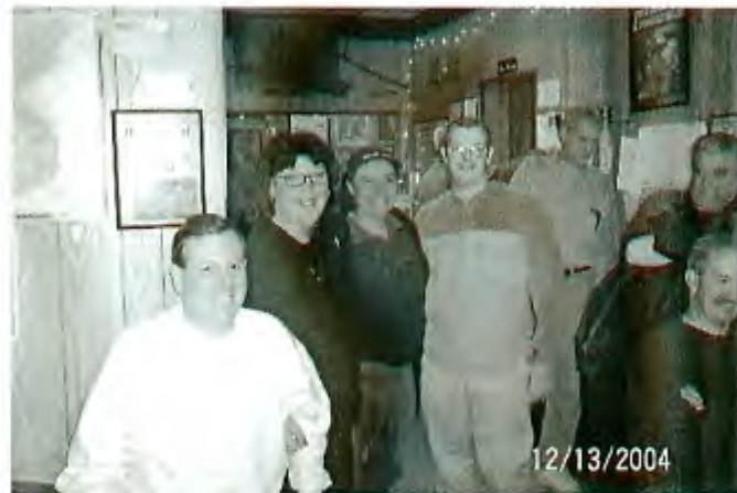
Standing room only, enjoying the show.