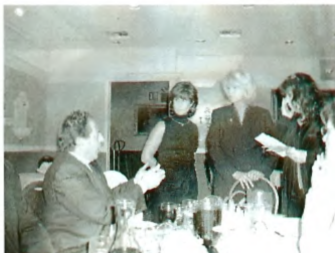
The New York City Verrazano 10-13 assists World of Women fundraiser, for vehicle needed by family.