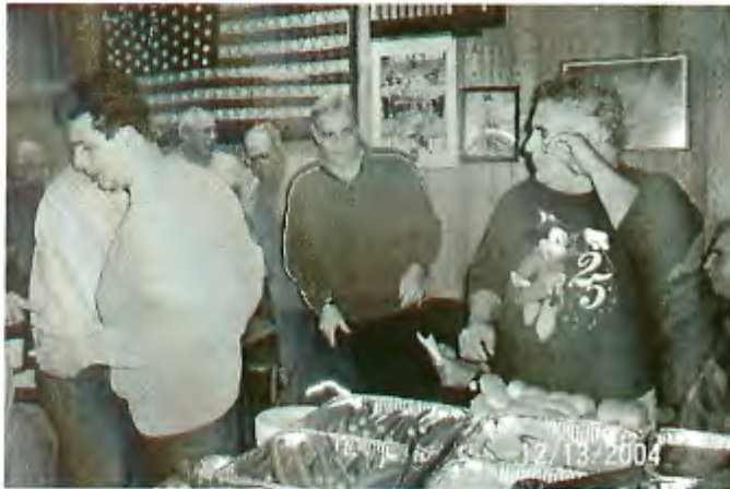
Holiday hot dogs enjoyed by all!