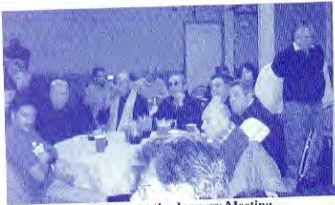
Full House at the January Meeting