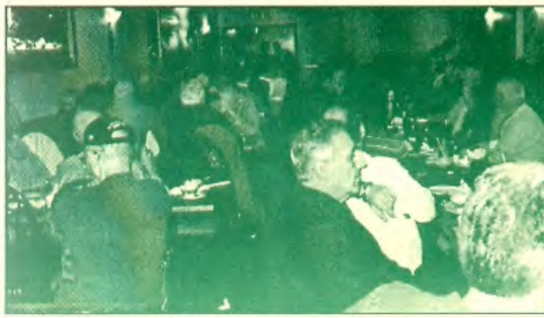
Holiday Luncheon - Full House