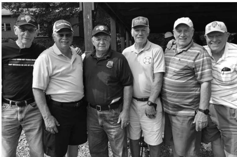
OVER THE HILL GANG 62 PCT