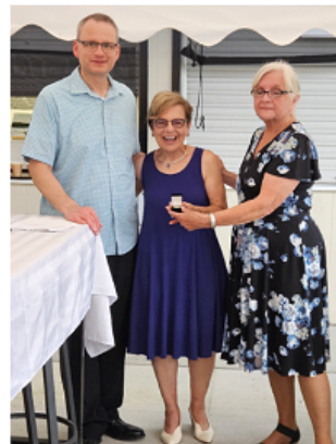
Maple Leaf Service Pin