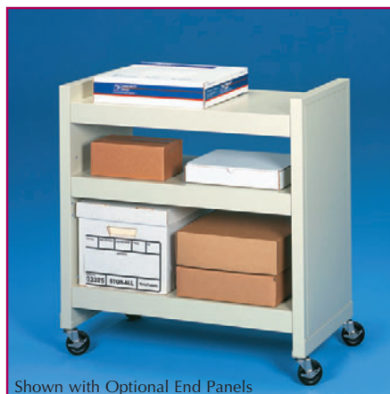
Shown with Optional End Panels