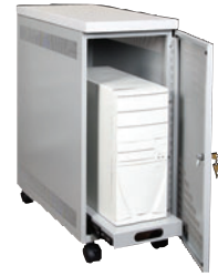
CPU Locker ™