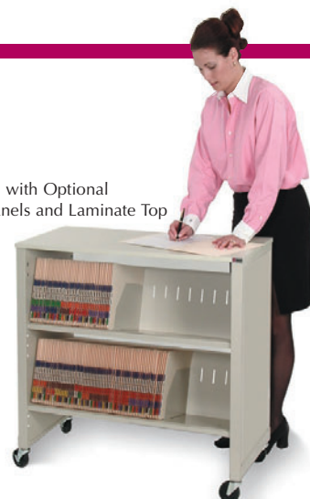
Shown with Optional End Panels and Laminate Top