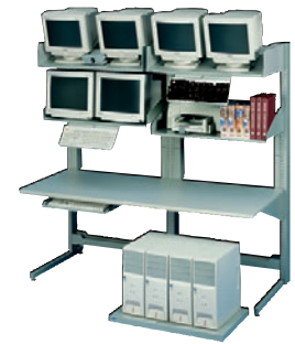
Technical Furniture Systems ™