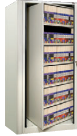
Ez2 ® Rotary Action File