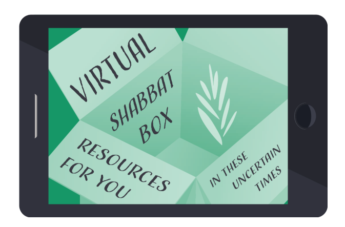
<u>Virtual Shabbat Box</u>. Includes essays, meditations for Shabbat