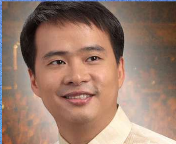
HON. DR. FRANCISCO T. DUQUE III, MSC UNDERSECRETARY - DEPARTMENT OF HEALTH (DOH)

Office of Senator Joel Villanueva Chairman, Senate Committee on Higher and Technical and Vocational Education Chairman, Senate Committee on Labor, Employment and Human Resources Development