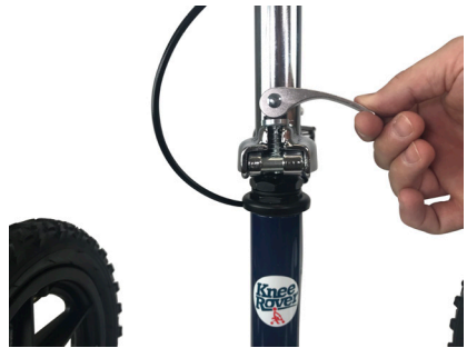
Push clamp down firmly