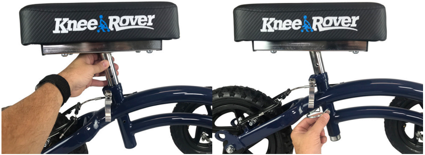
Insert Knee platform into the receptacle tube

The knee platform is designed to be used with either the right or left leg. Insert the knee platform post into the receptacle tube (Top Left). Next, set the knee platform at your desired height for use by inserting the locking pin through the aligned holes (Top Right). We recommend that the knee on the knee platform be at a 90 degree angle while the leg on the ground is straight. Finally, tighten the clamp lever to secure the knee platform in place (Bottom Left).