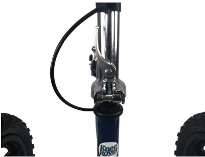
Raise the clamp into the “U” shaped slot