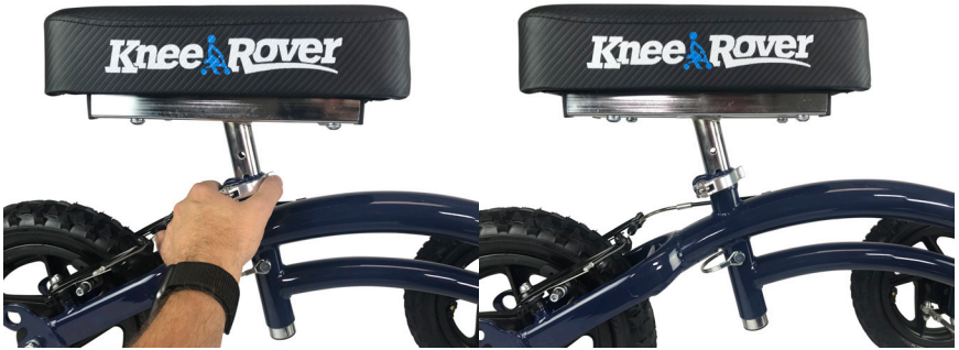
Tighten and secure the clamp