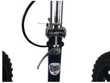
Raise steering column and release the pin