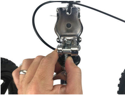
Push pin to the left

Raise the steering column up by pushing the clamp lever to the left allowing the column to raise all the way up (Top Left and Right). Raise the clamp lever upward in to the “U” slot and tighten by turning it clockwise (Bottom Left). Finally, push clamp lever down firmly to secure the steering column (Bottom Right). Reverse these steps when needing to lower steering column for transport.