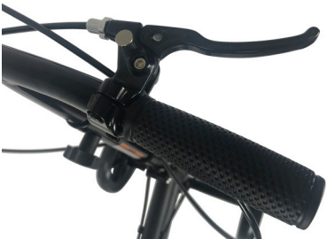
Parking Brake Unlocked