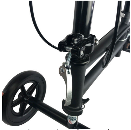
Raise steering column and release the pin