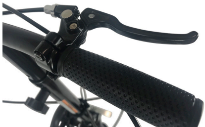
Parking Brake Locked