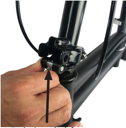
Push pin to the left

Raise the steering column and push the clamp lever to the left to allow security pin to lock into place (Top Left and Right). Raise the clamp lever upward into the "U" slot and tighten by turning it clockwise (Bottom Left). Finally, push clamp lever down firmly to secure the steering column (Bottom Right). Reverse these steps when needing to lower steering column for transport.