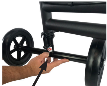
Pull Ring Down