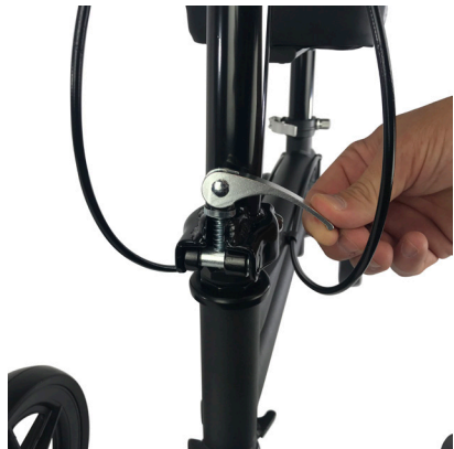
Push clamp down firmly