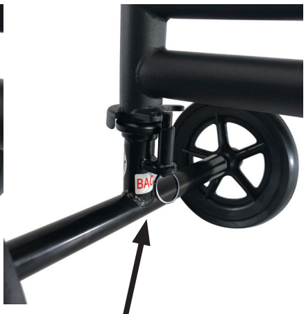
Release the ring and your guide pin is set