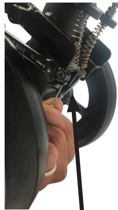
While holding the brake cable, retighten the 10mm nut