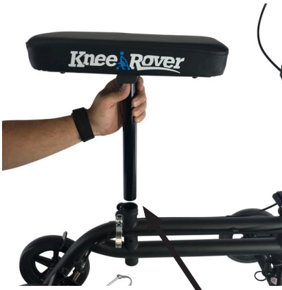
Insert Knee platform into the receptacle tube

The knee platform is designed to be used with either the right or left leg. Insert the knee platform post into the receptacle tube (Top Left). Next, set the knee platform at your desired height for use by inserting the locking pin through the aligned holes (Top Right). We recommend that the knee on the knee platform be at a 90 degree angle while the leg on the ground is straight. Finally, tighten the clamp lever to secure the knee platform in place (Bottom Left).