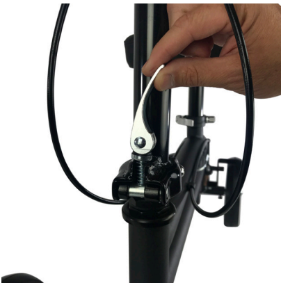
Raise the clamp into the "U" shaped slot