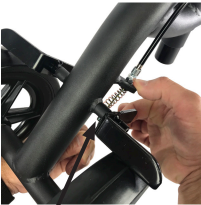
Squeeze spring together and pull the brake cable