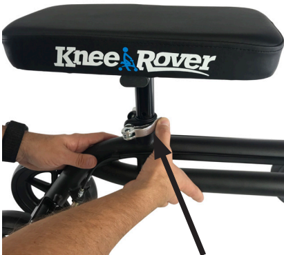
Tighten and secure the clamp