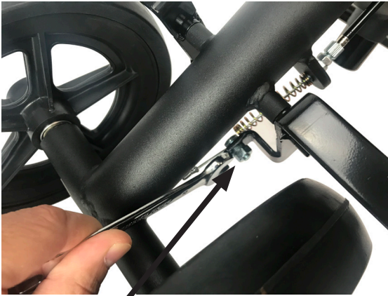
Loosen 10mm nut

You may also view the brake adjustment video by visiting https://kneerover.com/pages/kneerover-maintenance-videos .