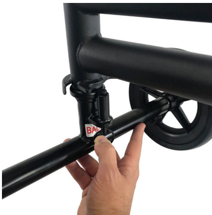
Rotate Front axle to where the guide pin is between the guide stops