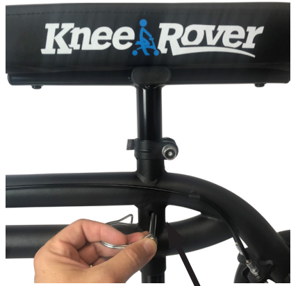
Insert the locking pin through the aligned holes