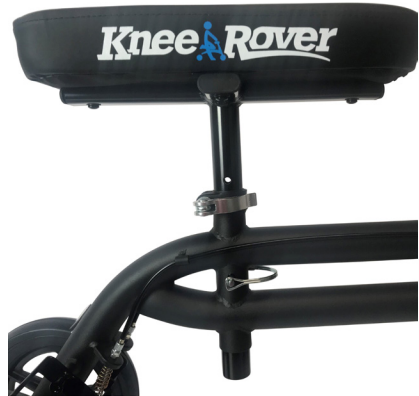
Properly assembled kneepad