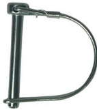
Kneepad Locking Pin

https://kneerover.com/pages/assembly-video