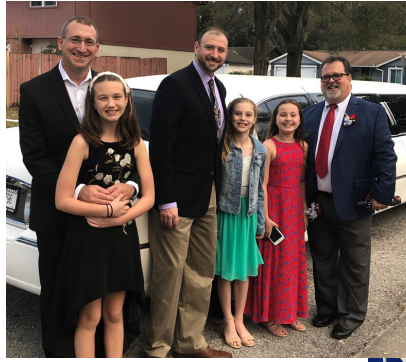
Father Daughter Dance