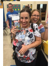
Popsicle Party Meeting