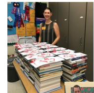
Battle Books ready to be distributed