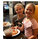
Night Out With Northwest