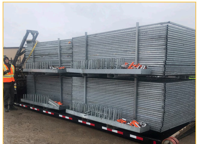
21' Rental Deck – added versatility in transporting fencing, scaffolding, containers, bins etc.