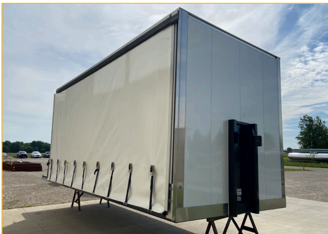
21' Curtainsider Van Body – For added weather protection to equipment