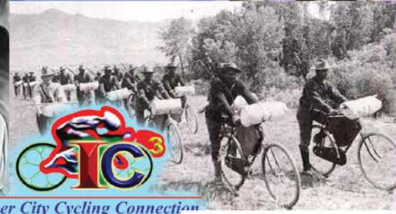
Inner City Cycling Connection